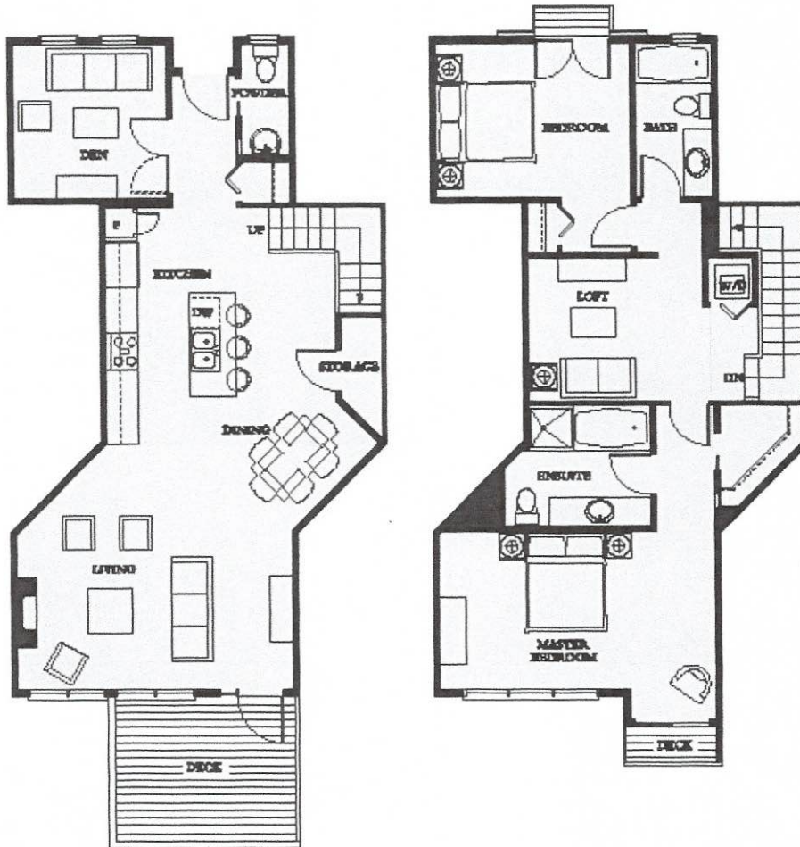
LOWER FLOOR 803 SF